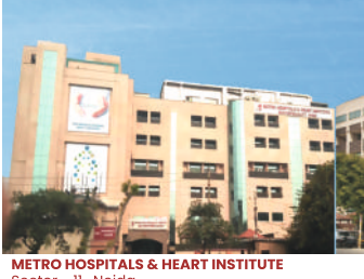
METRO HOSPITALS & HEART INSTITUTE Sector - 11, Noida